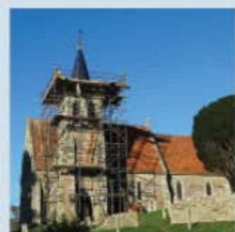
St Mary the Virgin Brook